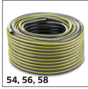
54, 56, 58