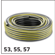
53, 55, 57