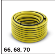
66, 68, 70