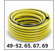
49-52, 65, 67, 69